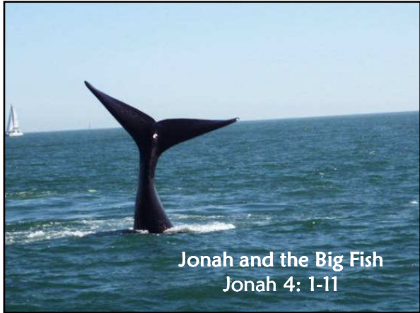
Jonah and the Big Fish Jonah 4: 1-11